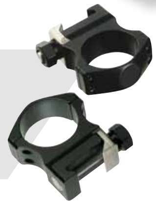
A set of our superb Nightforce 1.0" Ultralite rings is included.

A first-focal-plane reticle remains in the same visual proportion to the target across the scope's entire magnification range, making it especially appropriate with rangefinding reticles. Combined with Nightforce highly tactile and intuitive adjustments, it makes for a scope that is extremely quick, accurate and responsive.